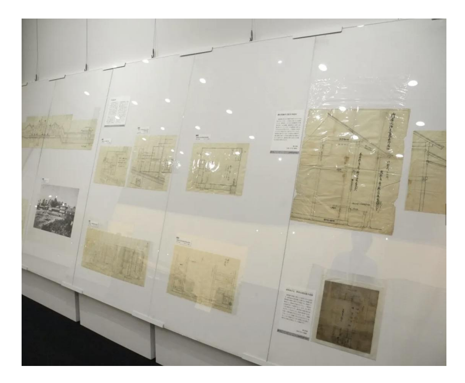
Fig 2"Drawings of Morioka Castle" introduces Morioka Castle as depicted in drawings.