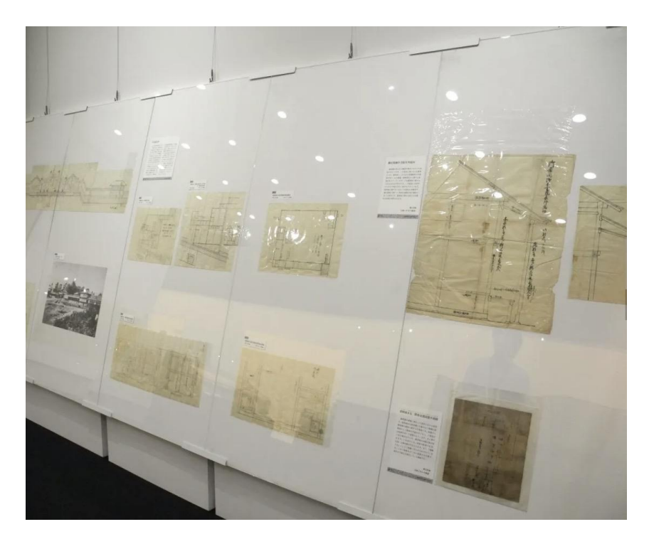
图 2 "盛冈城图鉴"----以插图形式介绍盛冈城

随着明治维新的推进,日本社会经历了剧烈变革。在这一时期,许多城堡被废弃 或拆除,盛冈城也未能幸免。城堡的大部分建筑在明治时代被拆除,只剩下石垣和部 分基础结构。